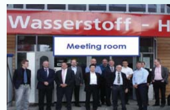
Task 28 Meeting - TOTAL Station Berlin