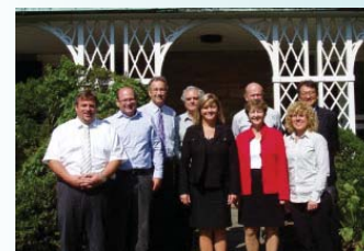
Task 30 Analysis Meeting at IEA HIA

THEME: H 2 AWARENESS, UNDERSTANDING & ACCEPTANCE